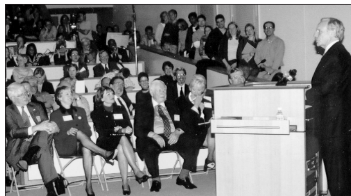
Lieberman lectures to capacity crowd.