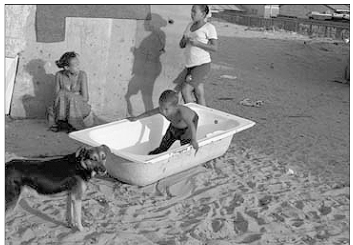
A child plays outside his home in Freedom Park, an informal settlement on the Cape Flats.