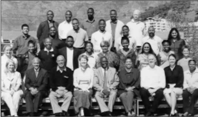
2003 Emerging Leader Program participants.