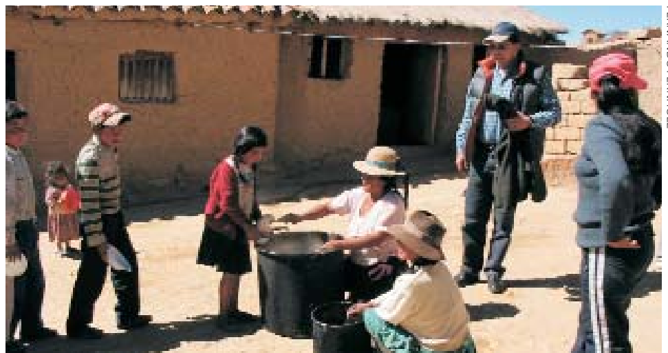
Schoolchildren line up for a meal in Poroma Village in Chuquisaca, Bolivia.