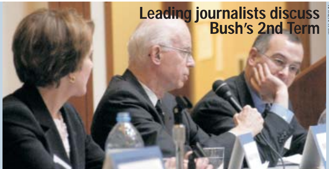
Political journalists Margaret Warner of "Lehrer NewsHour," David Broder of The Washington Post; and David Brooks of The New York Times, discuss President Bush's second term Jan. 15 during the 17th annual Zeidman Colloquium . About 200 people attended the panel discussion sponsored by the Institute's DeWitt Wallace Center for Communications and Journalism . Please see story, p. 4.