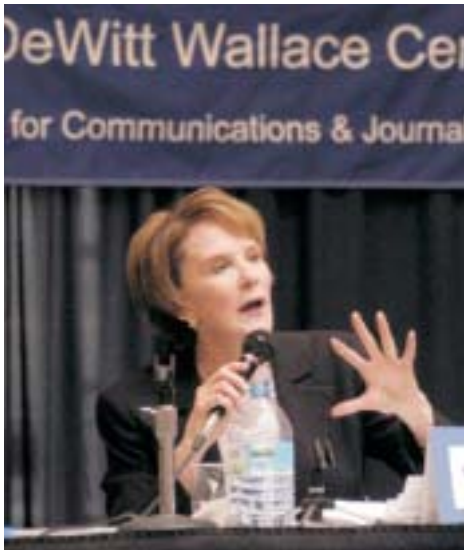
Margaret Warner, "Lehrer NewsHour" senior correspondent, responds to a question during the Jan. 15 Zeidman Colloquium.