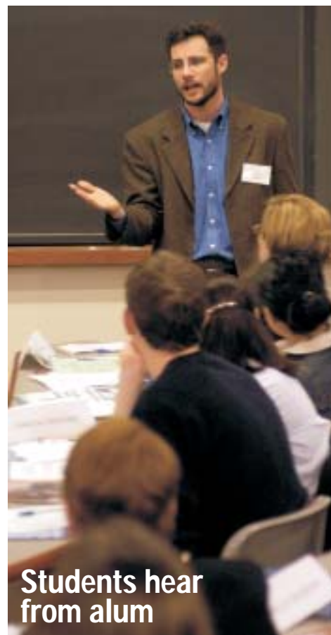
Students hear from alum