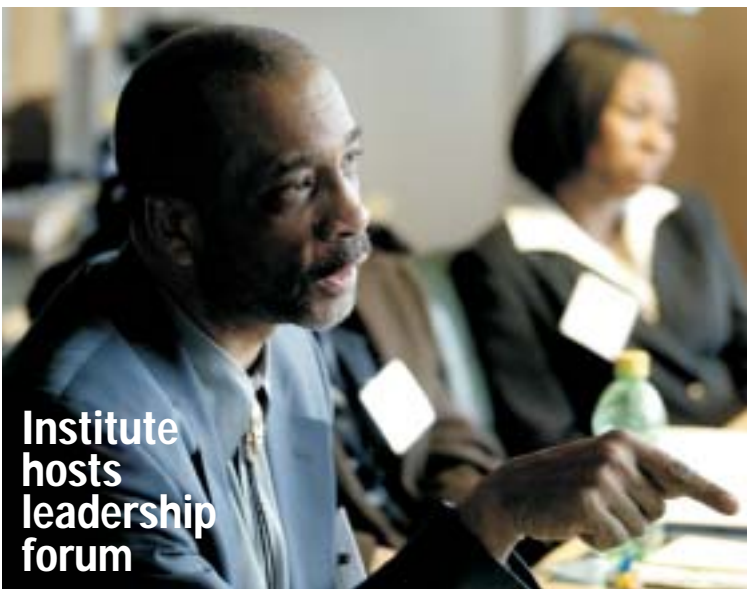
Institute hosts leadership forum