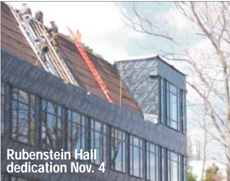
Rubenstein Hall dedication Nov. 4